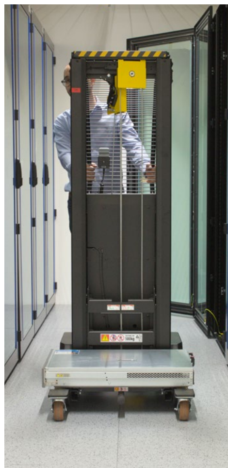
Clear forward view while moving