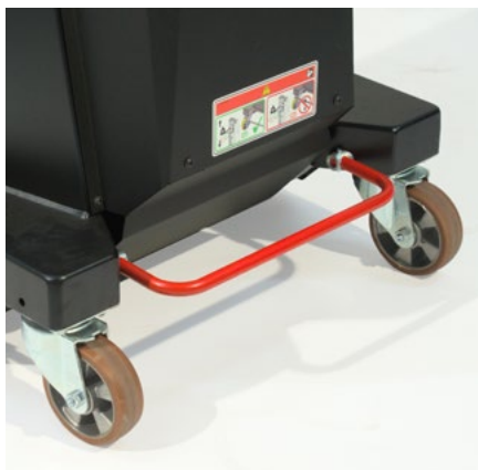
Wide brake lever