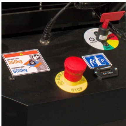
Emergency stop button