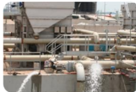
Water Treatment Facility