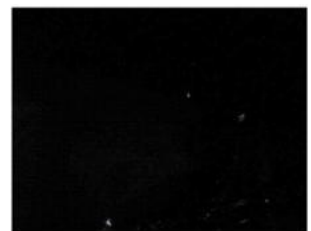
Without white light