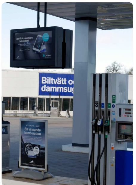
Image: Two PDS-47 landscape ceiling mounted enclosures for a Volvo forecourt, Sweden.