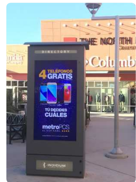
Image: A dual sided PDS-75" totem enclosure with air-conditioning for Indicium, El Paso, Texas.