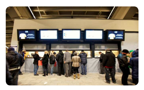
Image: Five PDS-42 landscape enclosures for a football stadium, Poland.