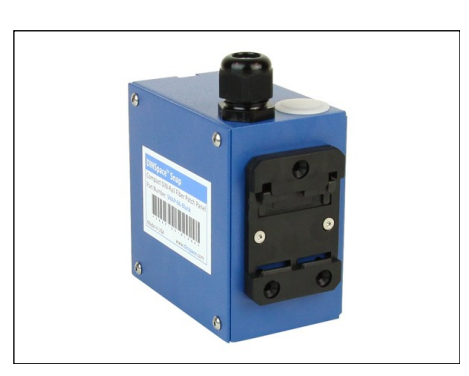
SN1 - rear side with DIN-Rail mount