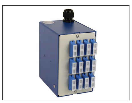
SN2 med adapters for 24 SC/PC SM connectors