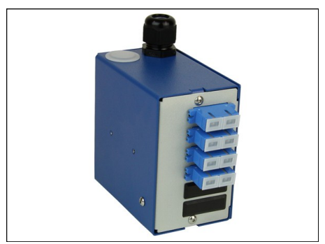
SN1 with adapters for 8 SC/PC SM connectors