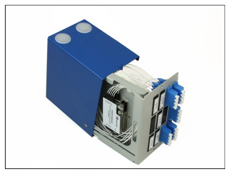
SN2 with 8+1 CWDM