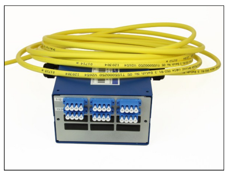
SN2 with 24 LC/PC and pre-terminated AXAI