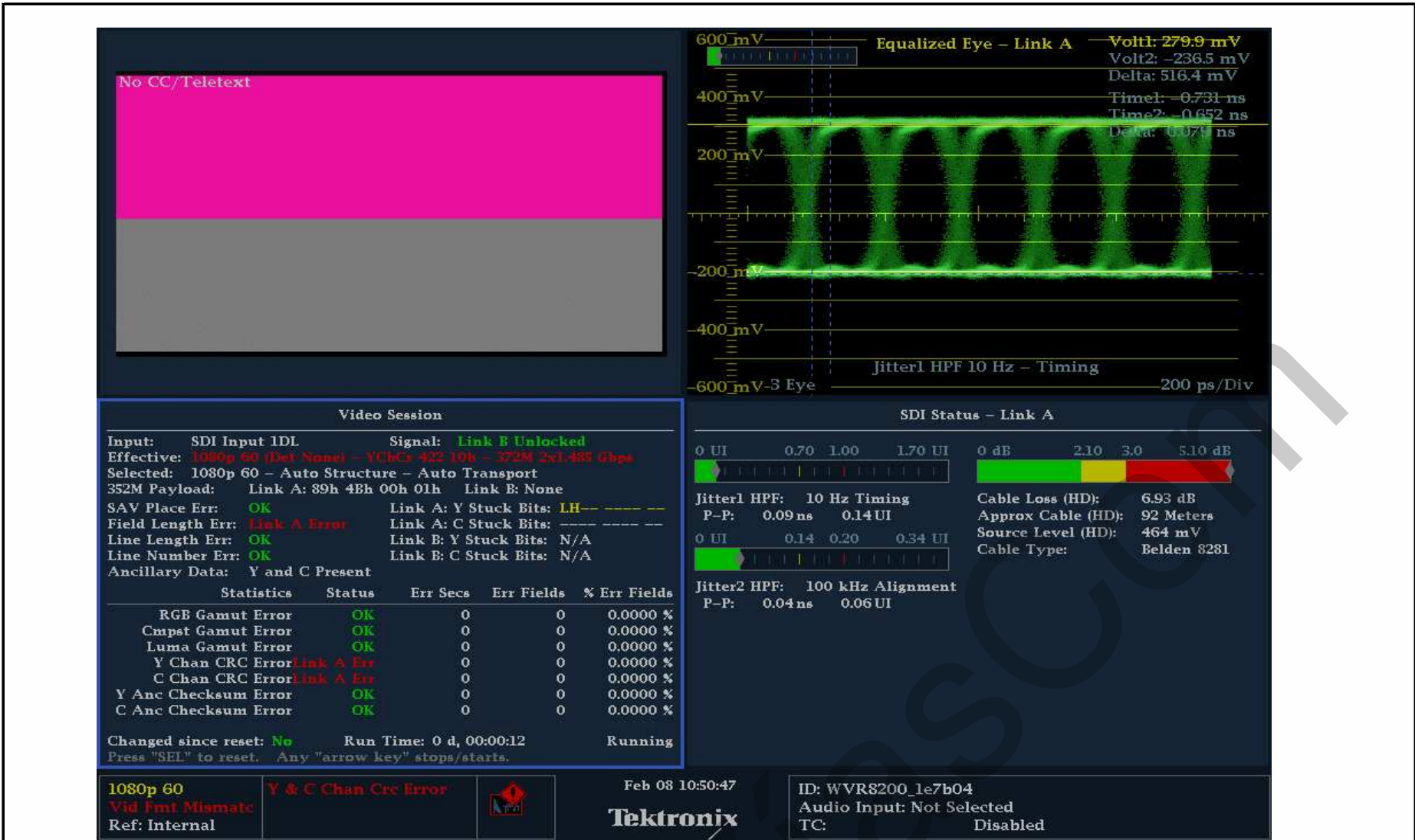
SMPTE 424m - 1,5 GHz / 3 Gbps - 85 meters

- Test performed using a Blackmagic Decklink SDI 4K capture/transmission card and a Tektronix WVR 8200 waveform monitor. - The errors, shown in red, observed during the 3 Gbps test occur because the Tektronix monitor used does not have the 3G option installed and, therefore, cannot automatically interpret the SMPTE 424M standard. However, when set manually, it can be seen that the signal is received correctly and there are no errors in the eye diagram.