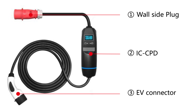
Figure 1 Schematic