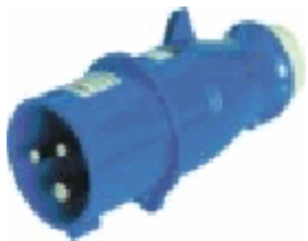
IEC60309 plug (16A 2P+E)