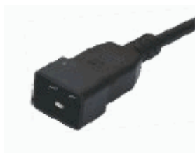
IEC320 C20 16A plug