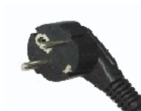
DIN49441 16A plug